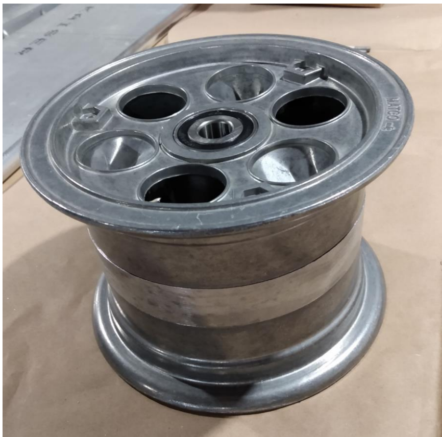
Matco NW600CC. Note the 1" spacer in the middle