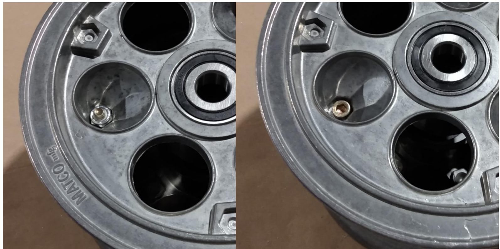
One side has nylon lock nuts – the other side has hex cap bolts